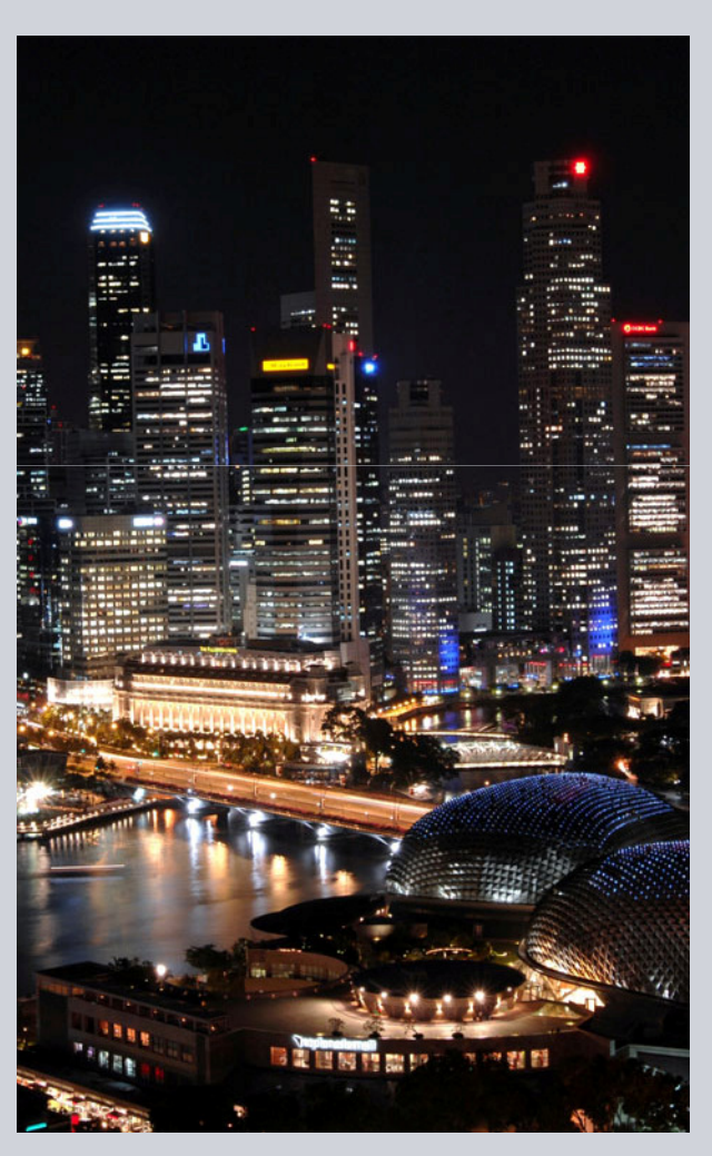
© Siemens AG 2010. All rights reserved. Siemens IT Solutions and Services

ICT has become an essential architecture that underpins city living - in improving quality of life, environment and economy